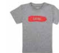
MINI WORDMARK T-SHIRT KIDS

£25.00 100% cotton (soft jersey) White/Island/Coral, standard size (6-9 months) 80 14 2460848