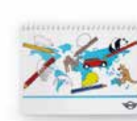
MINI COLOURING BOOK

£12.00 Paper: FSC-certified Crayons: FSC-certified Multicoloured 80 45 2445712 3 A4 sheets, crayons 9 × 1.6 × 1.6 cm