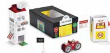
MINI KIDS CRAFT SET AUTOMOTIVE

£10.00 Cardboard Multicoloured 80 45 2445730 23 × 32.5 cm