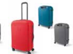
MINI TROLLEY £155.00

Island, Coral, Grey 80 22 2460878-76 55 × 35.5 × 23 cm 36 l volume