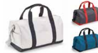
MINI COLOUR BLOCK DUFFLE BAG

Grey, Coral, Island 80 21 2460868-70 8.5 × 8.5 × 0.4 cm