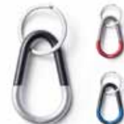
MINI COLOUR BLOCK KEYRING