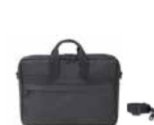
LAPTOP BAG £35.00

TOTEPACK 80 22 2460873 30.5 × 11.5 × 43 cm