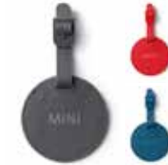
MINI LUGGAGE TAG