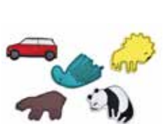
MINI IRON-ON PATCH SET

£10.00 Cardboard, labels, split pin Multicoloured 80 45 2445729 23 × 32.5 cm