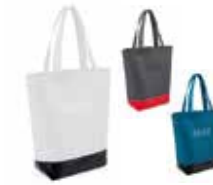
MINI COLOUR BLOCK SHOPPER £20.00

White/Black, Grey/Coral, Island/Black 80 22 2445671, 80 22 2460863-64 45 × 25 × 27 cm