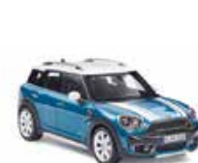
MINI COUNTRYMAN (F60) MINIATURE

£60.00 Die-cast Pepper White, Chili Red, Electric Blue 80 43 2405582 -84 1:18 scale