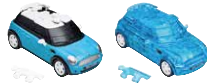
MINI HATCH COOPER S PUZZLE CAR

£100.00 Deck: polypropylene Wheels: polyurethane Black/Red/White 80 23 2460916 57 × 15.3 × 13 cm