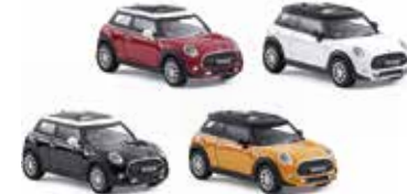
MINI HATCH (F56) MINIATURE

£5.00 Plastic Box of 24 in 3 colours (Chili Red, Electric Blue, Volcanic Orange) 80 44 2447939 1:36 scale