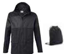
MINI JACKET WITH BACKPACK MEN'S £99.00