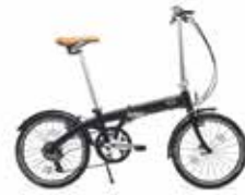
MINI FOLDING BIKE

£525.00 Aluminium, stainless steel Dark Grey 80 91 2413798 US: 80 91 2454881 Size: 150 × 110 × 60 cm Folded: 85 × 65 × 30 cm