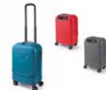
MINI CABIN TROLLEY £135.00

WALLET 80 21 2460871 13.5 × 1 × 9.5 cm POUCH 80 21 2460872 22 × 9 × 15 cm