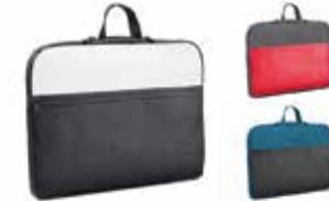
MINI COLOUR BLOCK LAPTOP SLEEVE

White/Black, Grey/Coral, Island/Black 80 21 2445661, 80 21 2460856-57 19 × 2 × 10 cm