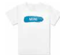
MINI WORDMARK T-SHIRT KIDS

£15.00 100% cotton with UV-protection finish Grey/Coral 98-128 80 14 2460824-29