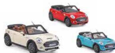
MINI CABRIO (F57) MINIATURE

£60.00 Die-cast Blazing Red, Midnight Black, Volcanic Orange 80 43 2413799, 80 43 2339558, 80 43 2413800 1:18 scale