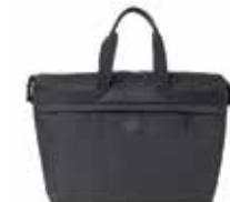
MINI TWO-TONE SERIES TRAVELLER BAG £89.00

Island, Coral, Grey 80 22 2460867-65 23 × 16 × 35 cm