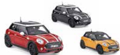
MINI COOPER S (F56) MINIATURE

£5.00 Die-cast, plastic Box of 36 in 4 colours (Blazing Red, Volcanic Orange, Midnight Black, Pepper White) 80 42 2339551 1:64 scale