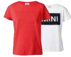
MINI WORDMARK T-SHIRT WOMEN'S £23.00