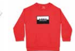
MINI LOGO PATCH SWEATSHIRT KIDS

£15.00 100% cotton with UV-protection finish White/Island 98-128 80 14 2460830-35