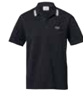
MINI LOGO PATCH POLO MEN'S £27.00