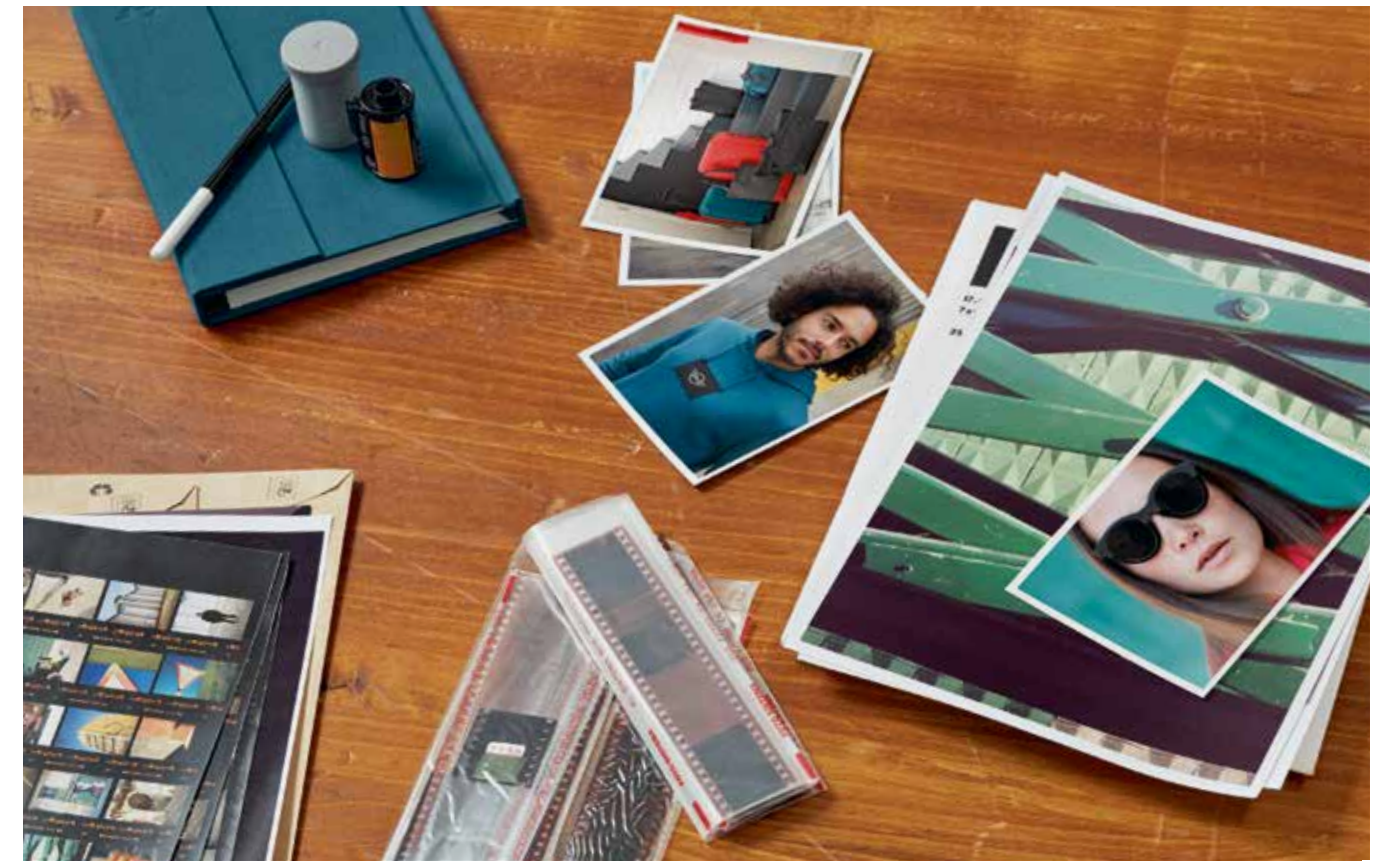
Left: Wordmark T-Shirt Women's Right: Cloth-Bound Notebook, Pencil Set, Walking Stick Umbrella, Cabin Trolley, Colour Block Shopper, Trolley, Two-Tone Totepack, Two-Tone Traveller Bag, Colour Block Duffle Bag, Luggage Tag, Logo Patch Sweatshirt Men's, Matt/Shine Panto Sunglasses

All products shown are available from your MINI Retailer and can also be ordered directly from the MINI Online Shop: