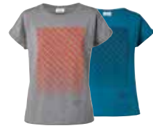
MINI SIGNET T-SHIRT WOMEN'S £25.00

Grey/Coral/White XXS-XL 80 14 2454921-26