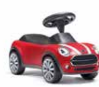
MINI BABY RACER

£60.00 Steel Chili Red 80 93 2451012 23 × 40 × 62 cm