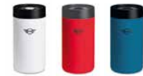
MINI TRAVEL MUG

White/Black, Island/Black 80 26 2460917-18 38 mm watch dial