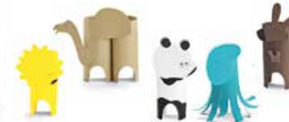
MINI KIDS CRAFT SET ANIMALS

£6.00 Paper: FSC-certified Multicoloured 80 45 2460914 A5