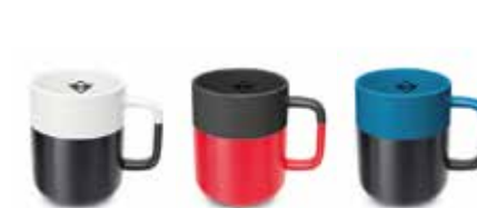
MINI COLOUR DIP CUP

Island, Coral, Grey 80 28 2460908-06 Capacity: 0.7 l