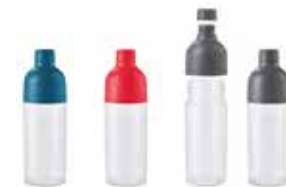
MINI COLOUR BLOCK WATER BOTTLE

Multicoloured 80 45 2460915 33 × 8 × 20.5 cm