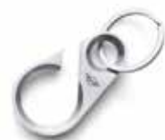
MINI BOTTLE OPENER KEYRING

Silver/Black 80 27 2445686 190 × 18 × 7 mm