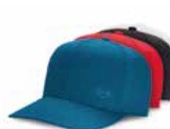
MINI SIGNET CAP £16.00