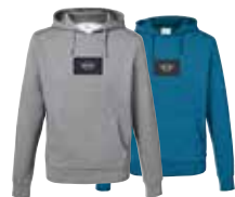
MINI LOGO PATCH SWEATSHIRT MEN'S £50.00