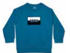
MINI LOGO PATCH SWEATSHIRT KIDS

£22.00 100% cotton Coral 98-128 80 14 2460836-41