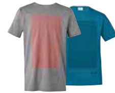
MINI SIGNET T-SHIRT MEN'S £25.00