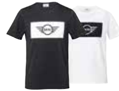
MINI WING LOGO T-SHIRT MEN'S £23.00

Island/Black/White S-XXXL 80 14 2460770-75