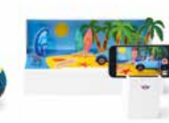
MINI MOVIE STAGE

£30.00 95% cotton, 3% polyester, 2% viscose Island 80 45 2460913 26 × 14 × 13 cm