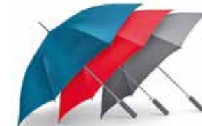
MINI WALKING STICK SIGNET UMBRELLA

Coral, Island, Grey 80 23 2460889-90, 80 23 2445719 Closed: 27 × 6 cm Diameter: 98 cm