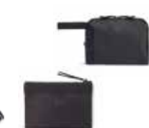
WALLET £20.00 £25.00

LAPTOP BAG 80 22 2460874 40 × 7 × 29.5 cm