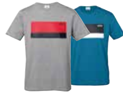
MINI WORDMARK T-SHIRT MEN'S £23.00