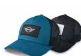
MINI LOGO PATCH TRUCKER CAP £20.00

Island, Coral, Black, White 80 16 2460850-49 80 16 2445652-51