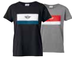
MINI WING LOGO T-SHIRT WOMEN'S £23.00