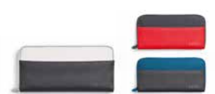
MINI COLOUR BLOCK WALLET

White/Black, Grey/Coral, Island/Black 80 22 2445667, 80 22 2460861-62 40 × 40 × 14 cm