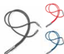
MINI TUBE LANYARD

Black/Silver, Black/Island, Grey/Coral 80 27 2460882-84 60 × 38 × 5.5 mm