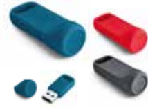
MINI USB KEY