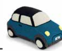
MINI KNITTED CAR

£20.00 FSC-certified beech Red 80 45 2460912 16 × 9 × 7 cm