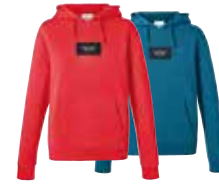
MINI LOGO PATCH SWEATSHIRT WOMEN'S £50.00