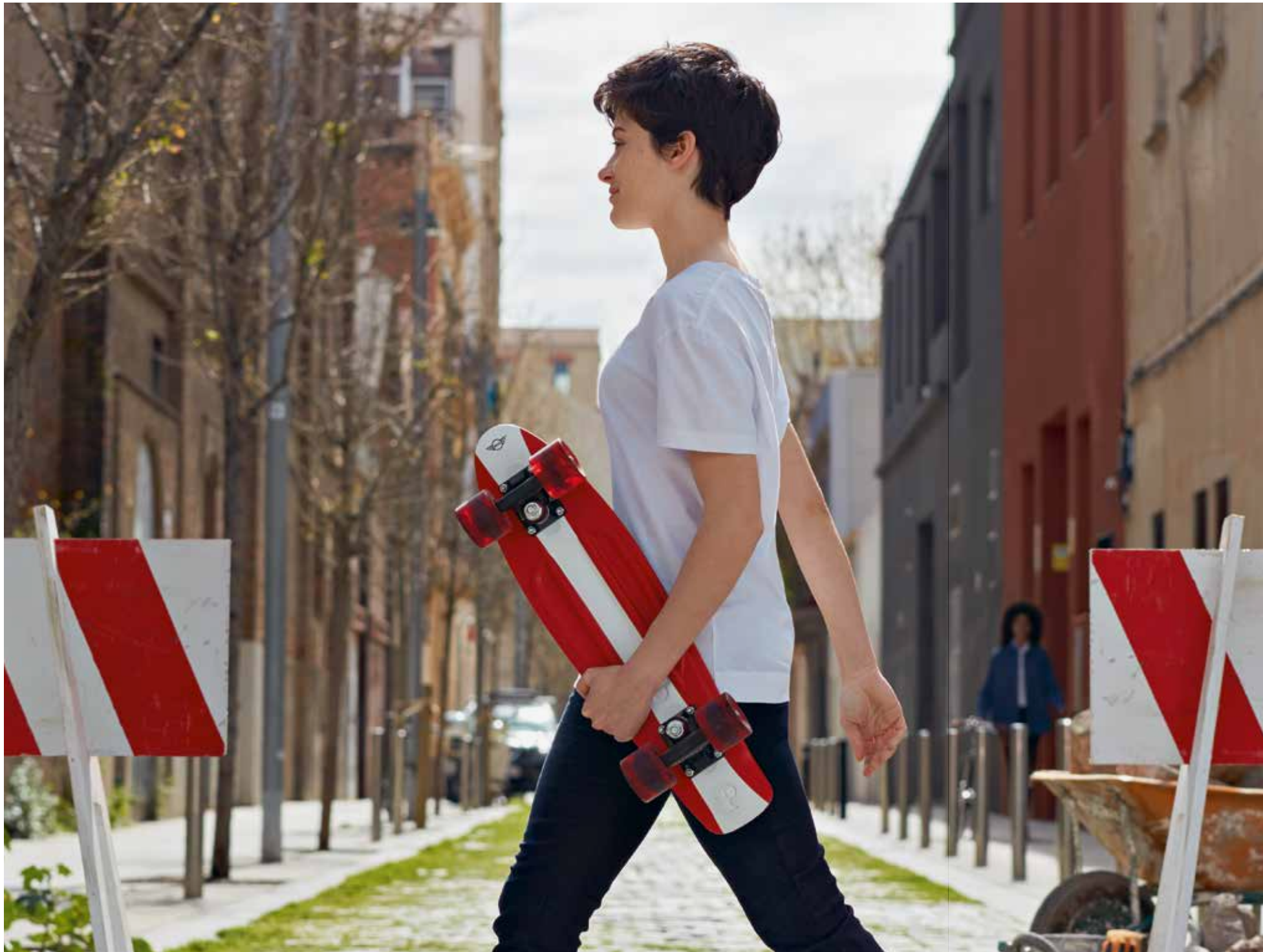
Left and right: Skateboard