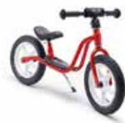
MINI BALANCE BIKE

£45.00 Aluminium, rubber, polycarbonate Black 80 92 2450930 Front light: 10 × 3 cm Rear light: 3 × 2 cm