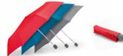
MINI FOLDABLE SIGNET UMBRELLA

Grey, Coral, Island 80 27 2460886-88 480 × 12 × 12 mm