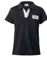
MINI LOGO PATCH POLO WOMEN'S £27.00