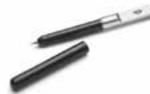
MINI FOUNTAIN PEN

Black/White 80 24 2445689 17.5 × 0.8 × 0.8 cm