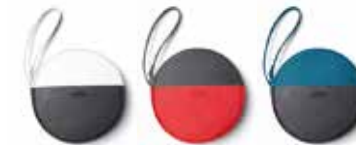
MINI ROUND COLOUR BLOCK POUCH

White/Black, Grey/Coral, Island/Black 80 21 2460858-60 35 × 2 × 26 cm