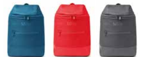
MINI TONAL COLOUR BLOCK BACKPACK

White/Black, Grey/Coral, Island/Black 80 21 2460853-55 15 × 2 × 15 cm