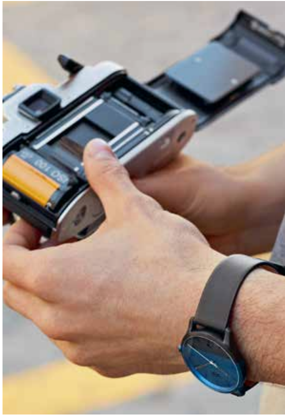
Left: Colour Block Watch Right: Walking Stick Signet Umbrella, Logo Patch Sweatshirt Men's