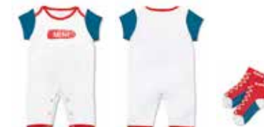
MINI BABY GIFT SET

£10.00 98% cotton, 2% viscose Multicoloured 80 45 2445714 10 × 7 cm