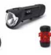
MINI BIKE LIGHT

£525.00 Aluminium, stainless steel Dark Grey 80 91 2413798 US: 80 91 2454881 Size: 150 × 110 × 60 cm Folded: 85 × 65 × 30 cm