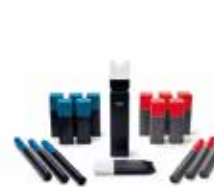
MINI KUBB GAME