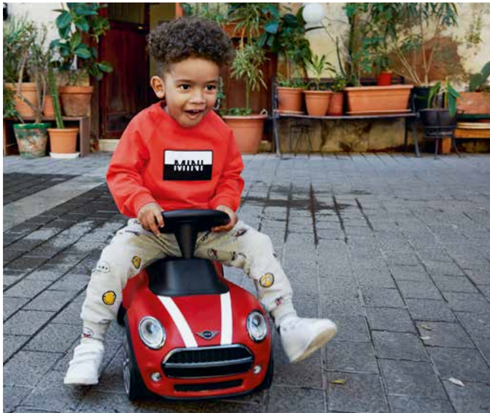
Left: Baby Racer, Logo Patch Sweatshirt Kids Right: Pull Toy Car