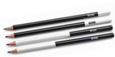
MINI PENCIL SET

Island, Coral, Grey 80 24 2460897-95 21.6 × 15.7 × 1.9 cm