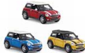
MINI COOPER S PULL BACK

£16.00 Plastic Blue paint finish/transparent Blue 80 44 2406541 -42 1:32 scale