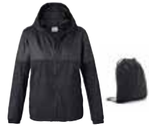
MINI JACKET WITH BACKPACK WOMEN'S £99.00