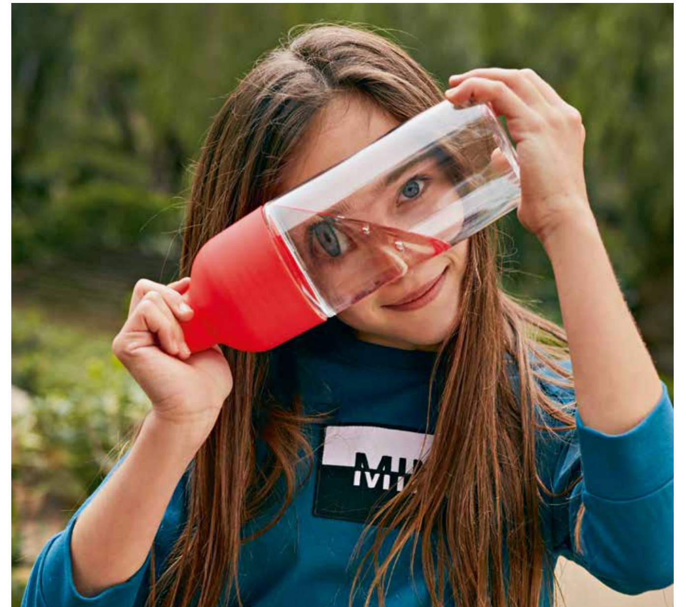
Left: Kubb Game, Signet T-Shirt Men's Right: Colour Block Water Bottle, Logo Patch Sweatshirt Kids