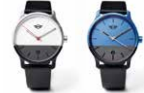
MINI COLOUR BLOCK WATCH

Silver/Black 80 24 2460900 130 × 11.5 × 11.5 mm