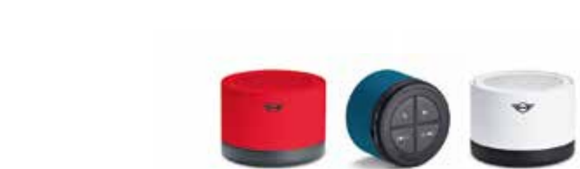
MINI BLUETOOTH SPEAKER

iPhone 7/8 80 21 2460921 iPhone 7/8 Plus 80 21 2460922