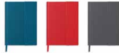
MINI CLOTH-BOUND NOTEBOOK