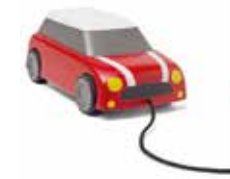
MINI PULL TOY CAR

£20.00 FSC-certified beech Red 80 45 2460912 16 × 9 × 7 cm